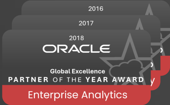
No. of Oracle Global Excellence Awards = 3