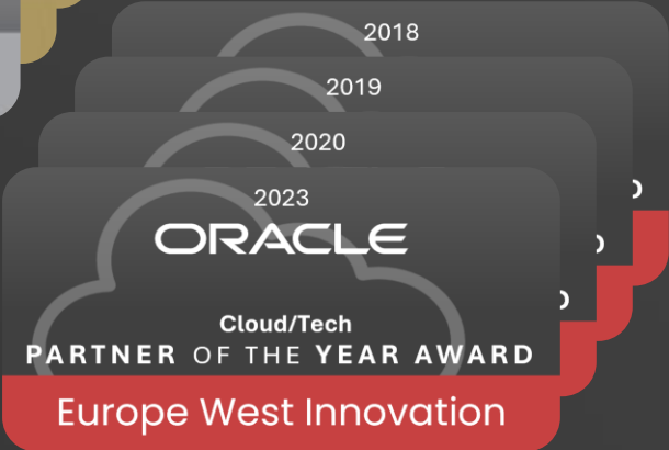
No. of Oracle Partner Awards = 4